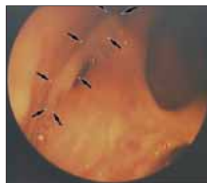
FIGURE 1. Location of the ectopic tonsillar tissue in the right pyriform recess of the hypopharynx

However, her condition did not improve, although she was treated by her general practitioner. She, therefore, visited our hospital in July 2008 to ask for a second opinion. When the first medical examination was performed by us using laryngopharyngeal fiberoptics, we observed a smooth mucosal swelling in the right pyriform recess but no vocal cord fixation (Figure 1). Computed tomography (CT) revealed no space-occupying lesion in the right pyriform recess (data not shown). From these observations, a preoperative diagnosis of a benign tumor was made. The swelling was restricted to the surface of the hypopharyngeal mucosa.