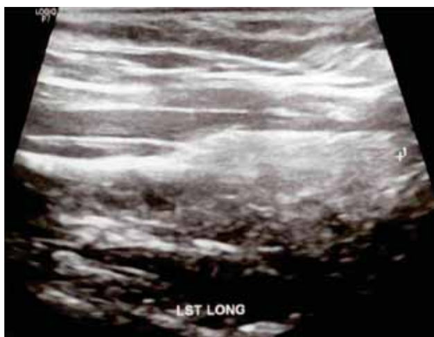
B (longitudinal aspect)