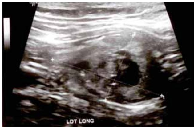
A (longitudinal aspect)