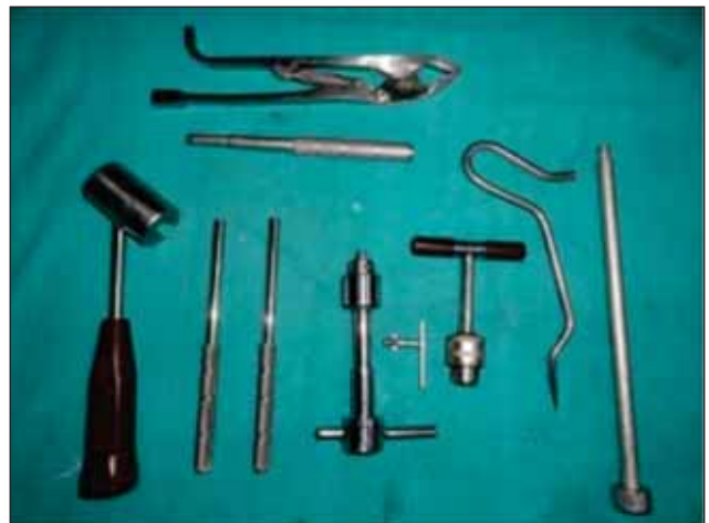
FIGURE 1. TEN instruments, it is consist of: Awl, Inserter, Extraction pliers, Cutter, and Impactor

Both plaster and stitches were removed 2 weeks after surgery. Partial weight bearing was started 2 weeks after surgery in cases of midshaft transverse fractures and delayed to 4 weeks in cases of oblique and comminuted fractures. All patients were followed radiographically until the fracture healed, and were reviewed clinically for leg-length discrepancy, rotational and angular deformities.