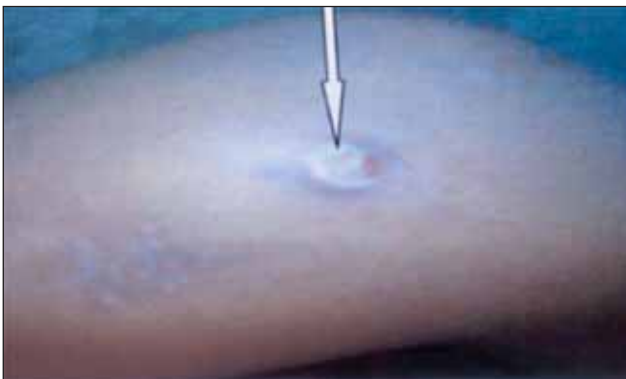
FIGURE 5. Irritation at nail insertion, skin irritation dead to bursitis (arrow), treated by nail removal

parallel to the metaphysis. The nail should not be bent at the end (12). Modified nail cutters prevent oblique nail cuts and sharp edges. Possible treatments for prominent nails include early removal, trimming of the nail end, advancement of the nail, exchange nailing, or observation.