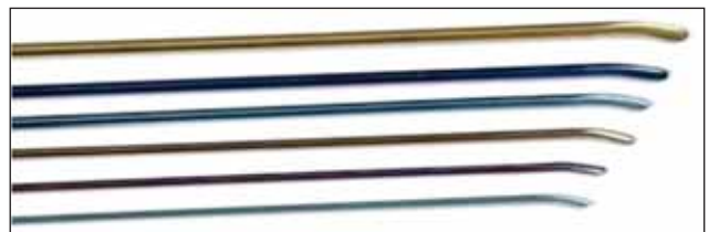
FIGURE 2. TEN, it is available in six diameter, 1.5 mm to 4 mm