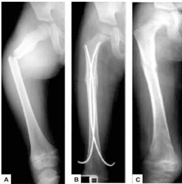
FIGURE 4. The outcome of elastic nail for the treatment of fracture of shaft of femur in pediatric aged 11 years: A – preoperative, B – postoperative, C – after nail removal.