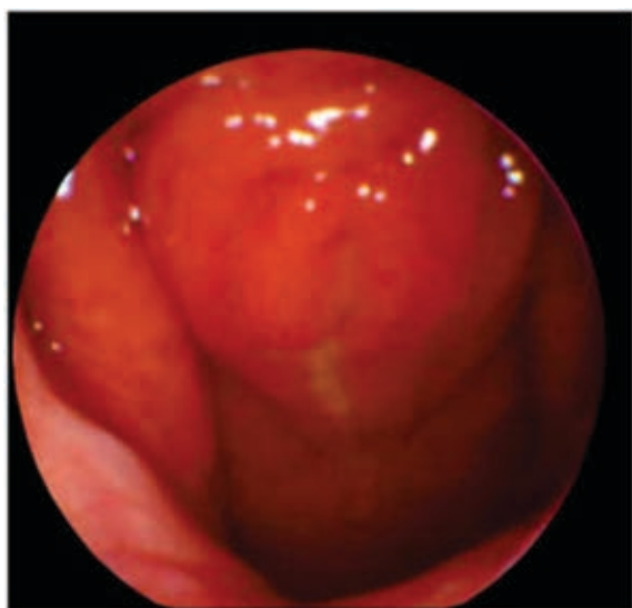
FIGURE 1. Enlarged adenoids in 7-year-old male patient- endoscopic image

Clinically, the paediatric patients diagnosed with CRS and chronic adenoiditis experienced minimum two of the symptoms: nasal obstruction, hyposmia/anosmia, mucopurulent nasal discharge, anterior/posterior nasal drip sensation, facial fullness, facial pressure.