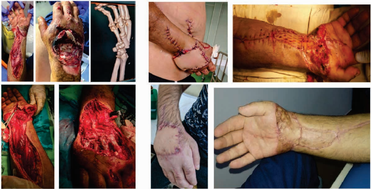
FIGURE 6. Crush injury with an unstable wound

of the hand and skin graft for the volar aspect of the wrist.