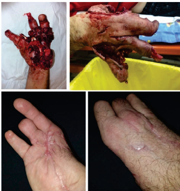
FIGURE 2. Firecracker explosion – presentation and follow-up

The upper limb amputation poses a higher social, aesthetic and functional impact than lower limb amputation, with higher rates of prosthetic rejection, needing complex rehabilitative protocols. Functional recovery is faster in case of lower limb amputation, with faster social reintegration, compared to upper extremity amputation [9,16,17].