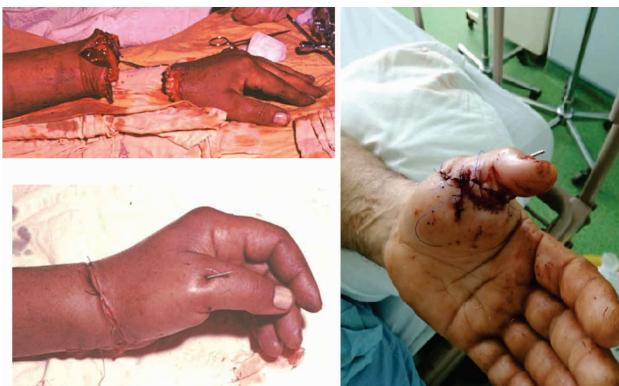
FIGURE 3. Cases of replantation

Vascularized bone should be saved for reintegration, as well as vascularized soft tissues in order to attempt coverage or closure. Salvage of spare parts should be attempted whenever possible, usable lat-