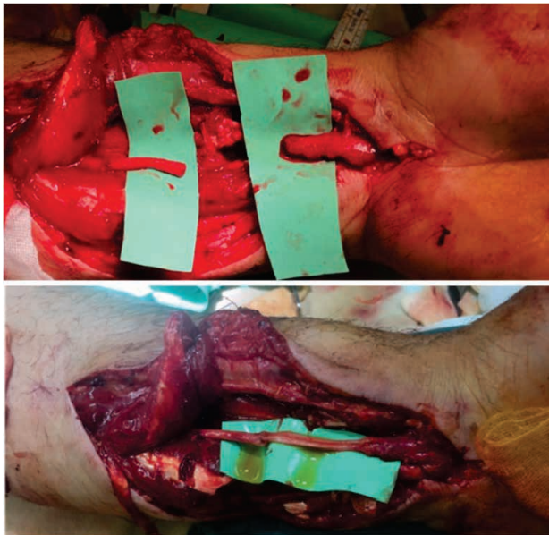
FIGURE 5. Median nerve gap, followed by repair using sural graft

Nerve repair is the next step after skeletal, tendon and vascular repair and should be performed under the microscope, with proper alignment. This represents the last step before soft tissues coverage. Even though nerve grafts and nerve transfers gain more and more popularity lately, one should take into consideration that primary end-to-end nerve repair represents the therapeutic gold standard [24].