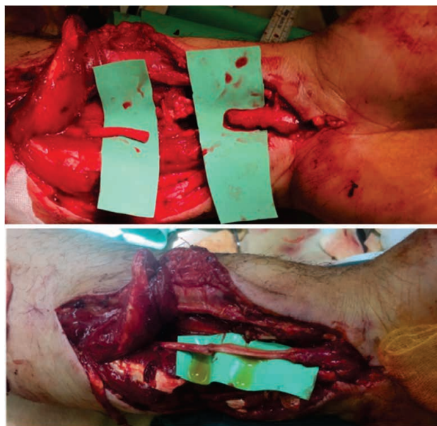
FIGURE 5. Median nerve gap, followed by repair using sural graft

Nerve repair is the next step after skeletal, tendon and vascular repair and should be performed under the microscope, with proper alignment. This represents the last step before soft tissues coverage. Even though nerve grafts and nerve transfers gain more and more popularity lately, one should take into consideration that primary end-to-end nerve repair represents the therapeutic gold standard [24].