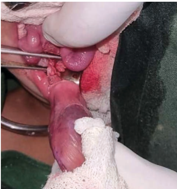
FIGURE 3. Surgical procedure

Post-mass excision, the surgical site underwent meticulous closure in layers using 4-0 vicryl. This careful approach aimed not only to ensure an aesthetically pleasing result but also to promote optimal healing and minimize the risk of postoperative com-