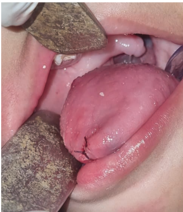
FIGURE 5. Post-operative examination

The postoperative phase marked a critical juncture in the management journey, emphasizing the need for ongoing monitoring and follow-up to ensure sustained improvements and to address any potential complications that may arise. The integration of surgical expertise, careful wound management, and vigilant postoperative care collectively contributed to the favorable outcome observed in the child's recovery from this challenging oral condition.