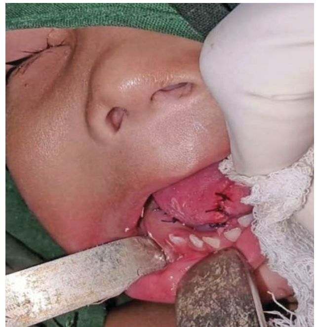
FIGURE 4. Wound closure