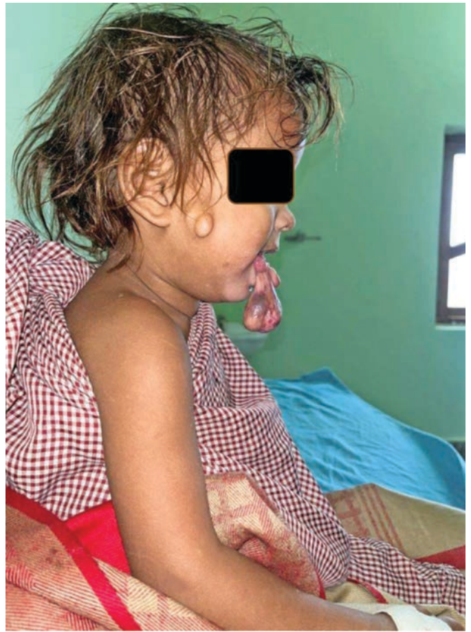
FIGURES 1-2. Patients' pictures with lateral view

plete dissection, followed by the excision of the masses from both the tongue and buccal mucosa. The decision to opt for surgical intervention was guided by the necessity to alleviate feeding, breathing, and speech difficulties, which were directly attributed to the size and location of the hamartomas.